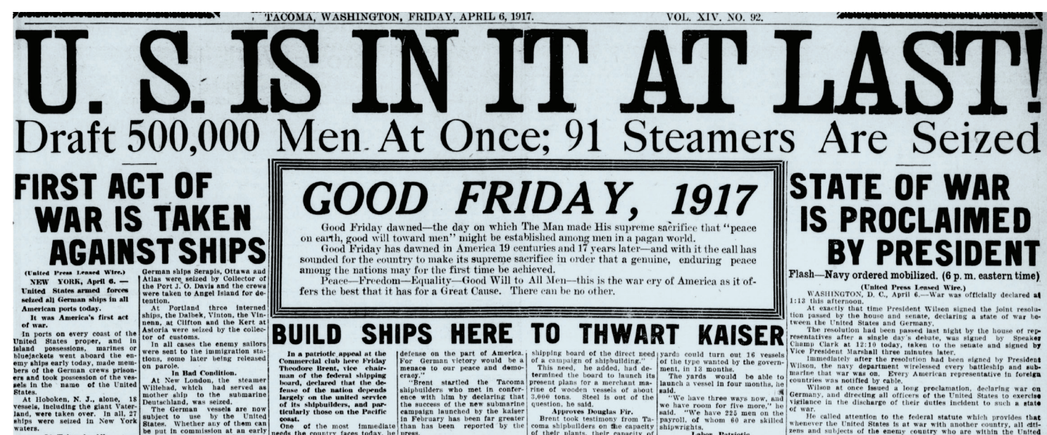
Headline from The Tacoma Times, April 6, 1917.

The Bureau of Immigration played a key role in the U.S.'s first act of war. Minutes after the U.S. declared war on Germany on April 6, 1917, immigration officers stationed at U.S. ports received pre-arranged telegrams ordering them to "proceed immediately."