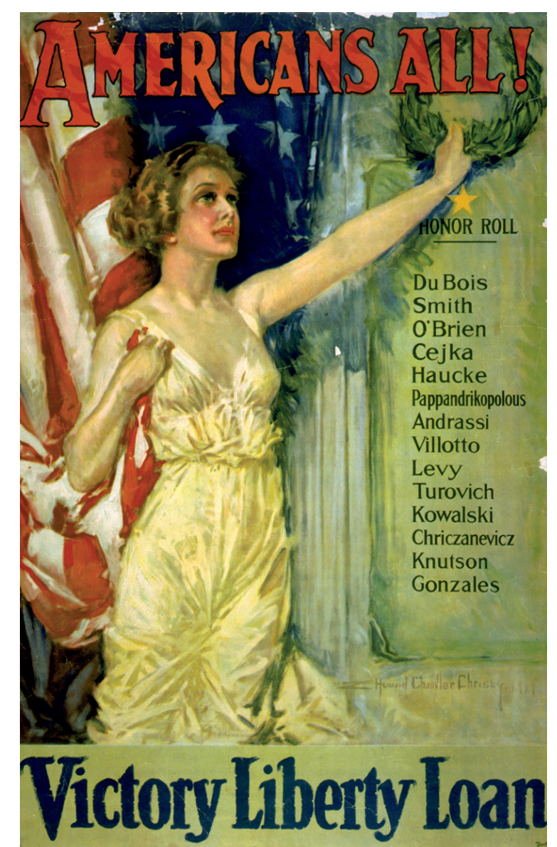
This 1919 Victory Liberty Loan poster by Howard Chandler Christy highlighted the diversity of the American armed forces.

Whether overseas or stateside, immigrants served honorably in WWI, often before they earned their American citizenship. Many immigrants proudly viewed their WWI service as a transformational event in their lives and a key part of their identities as new Americans.