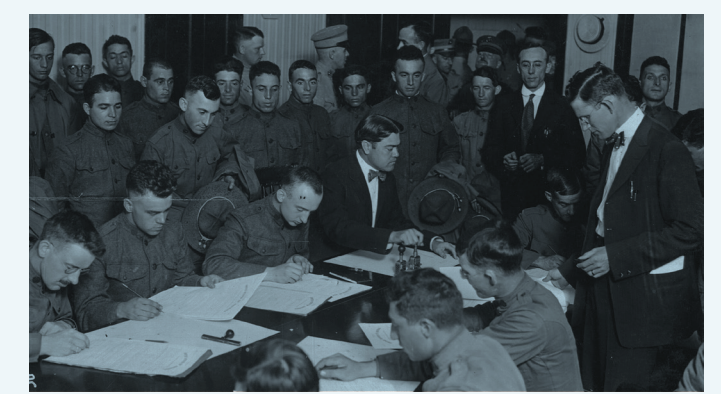
Foreign-born soldiers filling out naturalization applications in Washington, D.C., 1918.

bases and enlisted volunteer attorneys and hastily-trained servicemen as temporary examiners. Often, judges traveled to bases to hold large, open-air naturalization ceremonies. Under this system a foreign-born soldier could become a citizen in just one day.