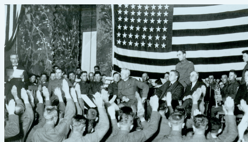
Soldiers at Camp Upton, New York, swear the Oath of Renunciation and Allegiance to become U.S. citizens, circa 1918-1919.

Under the Act of May 9, 1918, service members only needed proof of enlistment and testimony from two witnesses to naturalize. The law exempted them from