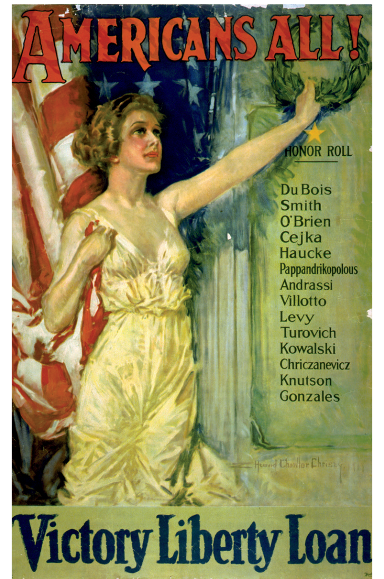
This 1919 Victory Liberty Loan poster by Howard Chandler Christy highlighted the diversity of the American armed forces.

Whether overseas or stateside, immigrants served honorably in WWI, often before they earned their American citizenship. Many immigrants proudly viewed their WWI service as a transformational event in their lives and a key part of their identities as new Americans.