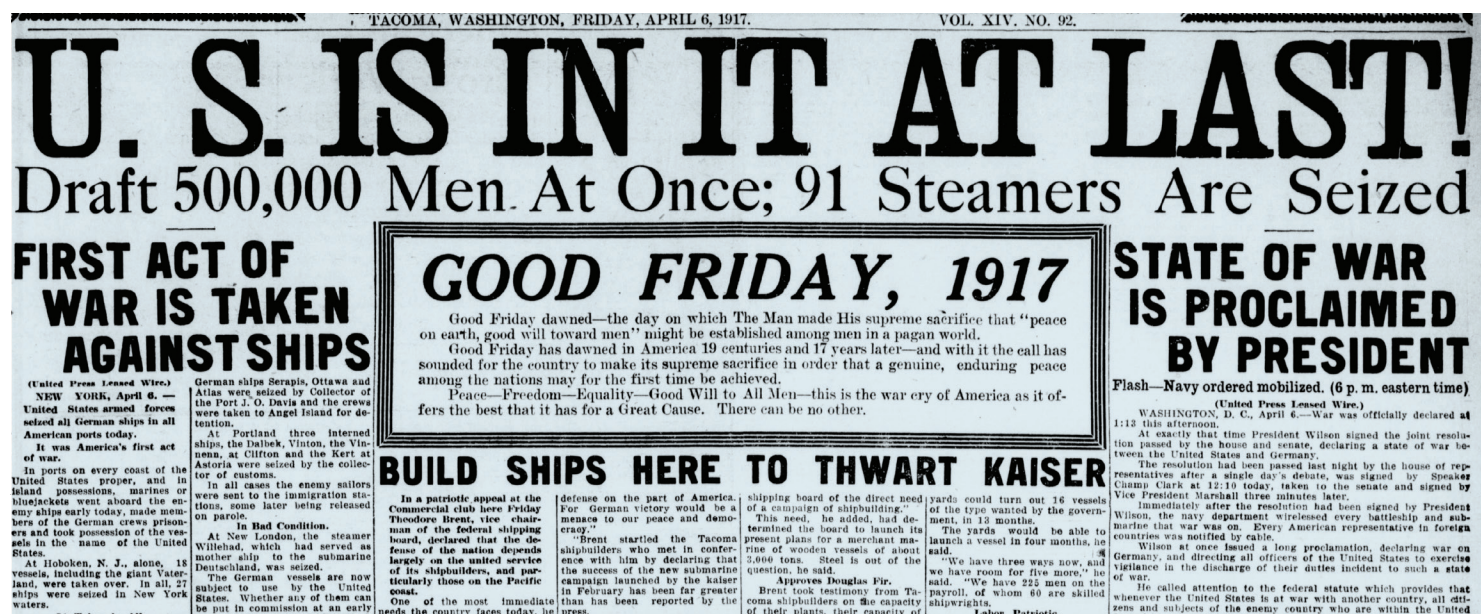
Headline from The Tacoma Times, April 6, 1917.

The Bureau of Immigration played a key role in the U.S.'s first act of war. Minutes after the U.S. declared war on Germany on April 6, 1917, immigration officers stationed at U.S. ports received pre-arranged telegrams ordering them to “proceed immediately.”