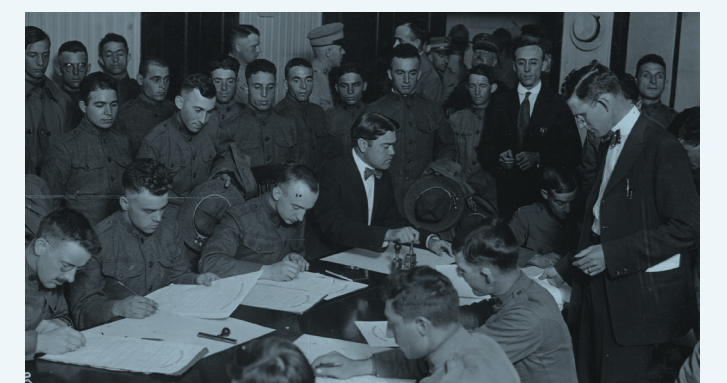
Foreign-born soldiers filling out naturalization applications in Washington, D.C., 1918.

bases and enlisted volunteer attorneys and hastily-trained servicemen as temporary examiners. Often, judges traveled to bases to hold large, open-air naturalization ceremonies. Under this system a foreign-born soldier could become a citizen in just one day.