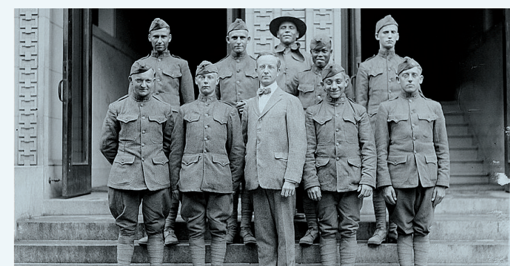
Commissioner of Naturalization Raymond F. Christ (center) with newly naturalized soldiers, Washington, D.C., 1918.