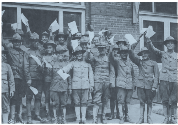
Newly naturalized soldiers in Washington D.C. wave their naturalization certificates, September 13, 1918.

USCIS's legacy agencies, the Bureau of Immigration and the Bureau of Naturalization, played significant roles in the U.S. effort during WWI. Their wartime activities began on April 6, 1917, the night the U.S. entered the war, when immigration officers received immediate orders to detain the crews of German merchant ships docked at U.S. ports. The Bureau of Immigration oversaw the internment of these German crews for most of the conflict.