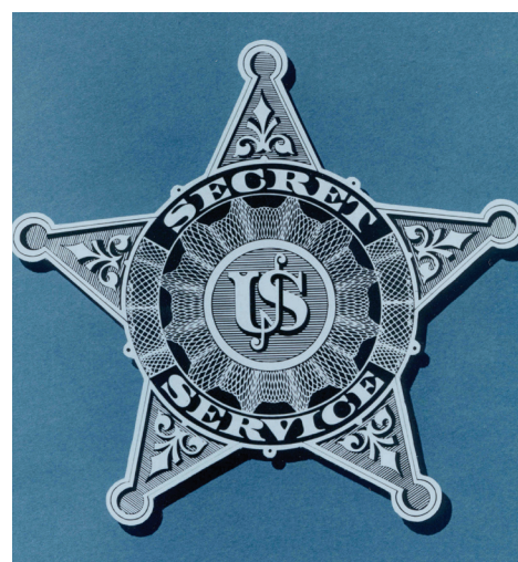
U.S. Secret Service agency seal and special agent badge, 1890-1971. The badge's five points represent Justice, Duty, Courage, Honesty, and Loyalty.

On May 14, 1915, President Woodrow Wilson directed the Secretary of the Treasury to have the Secret Service investigate espionage that may have violated the President's Neutrality Proclamation.