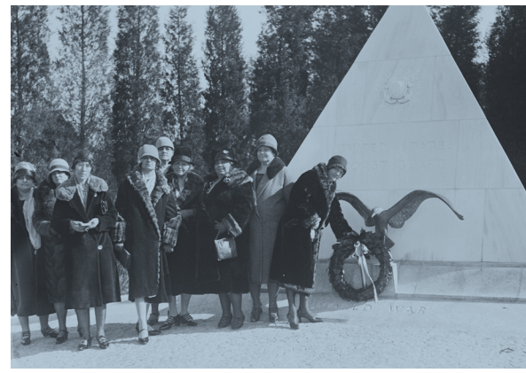
Members of the League of Coast Guard Women commemorate WWI losses at the Coast Guard Memorial in Arlington National Cemetery on November 9, 1928.

Upon the declaration of war, every Coast Guard cutter and shore station received a coded dispatch that transferred its officers, enlisted men, vessels, and units to the operational control of the Navy. The Coast Guard contributed 223 commissioned officers, more than 4,500 enlisted men, 47 cutters, and 279 U.S. coastal stations to the Navy. Six ocean-going cutters travelled to Europe on convoy duty, while smaller cutters patrolled home waters. Coast Guard officers commanded several naval air stations and transports in the U.S. and Europe. Others became captains of the port, the largest being the Port of New York, a duty the service still carries out today.