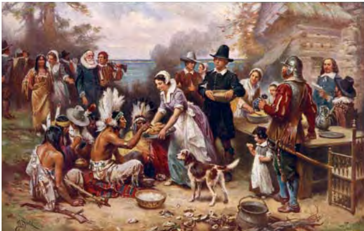
"The First Thanksgiving 1621" by Jean Leon Gerome Ferris. Courtesy of the Library of Congress, LC-USZC4-4961.

The Indians helped the Pilgrims with many things.