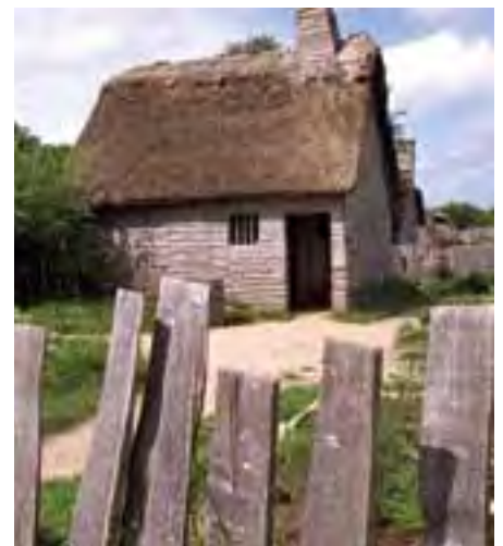
A photo of Plimoth Plantation in Plymouth, MA, a recreation of the original Plymouth colony.

Life was better in Plymouth the next year.