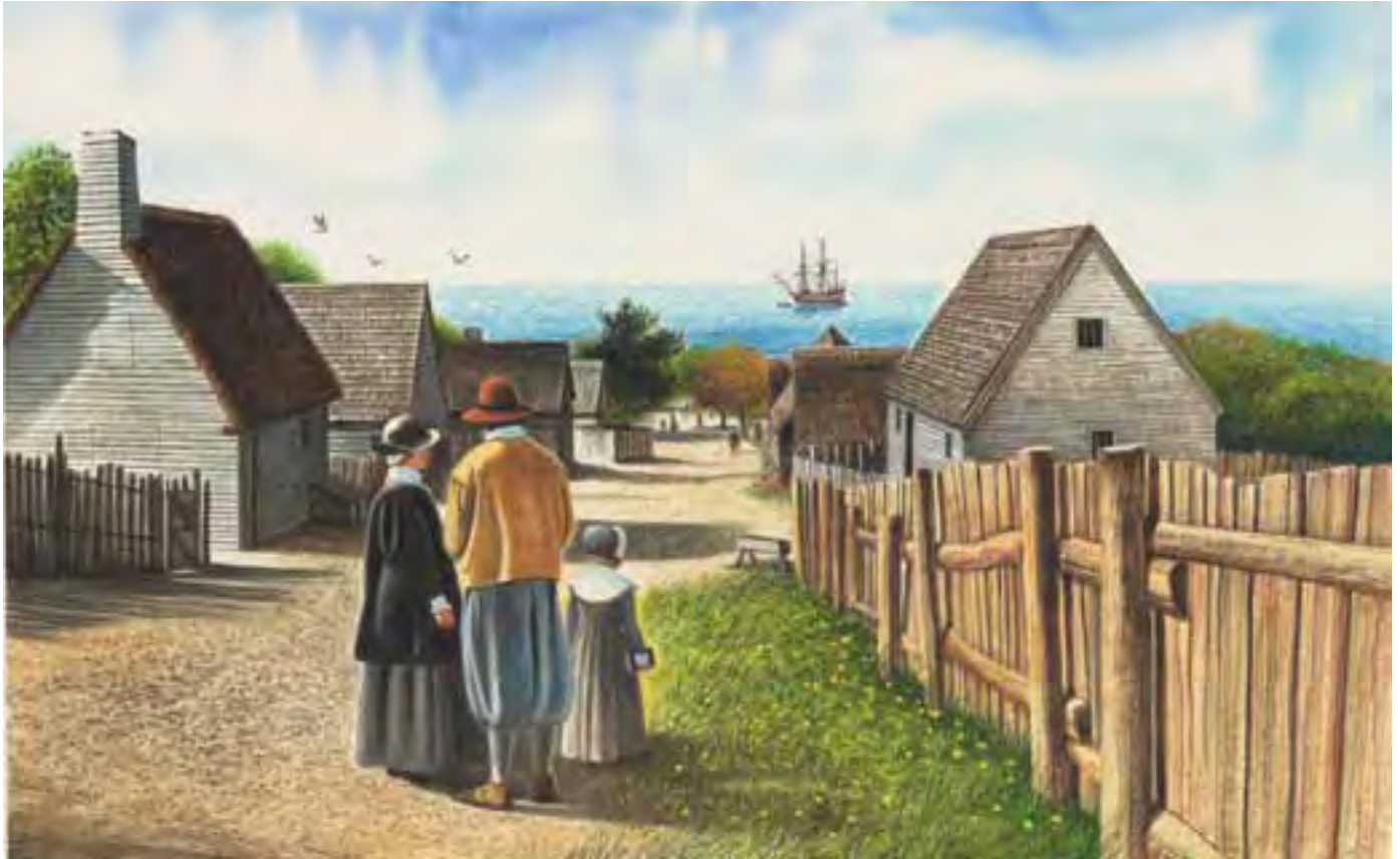
“O Beautiful for Pilgrim’s Feet”

Illustration © 2003 by Wendell Minor, from the book “America the Beautiful.” GP Putnam’s Sons.